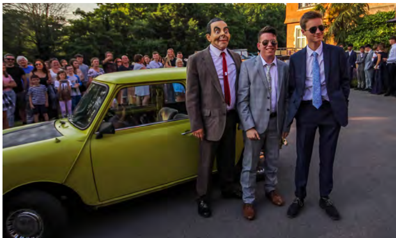
Mr Bean joins in the fun at The Arnewood School Prom

Results day is on Thursday 22nd August and we would like to wish everybody all the best for their future. Good luck to those venturing to pastures new; we look forward to welcoming those who are returning in September to further their studies at The Arnewood School.