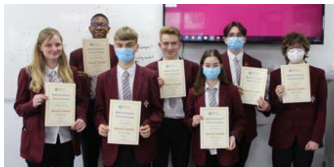
BRONZE CERTIFICATE WINNERS