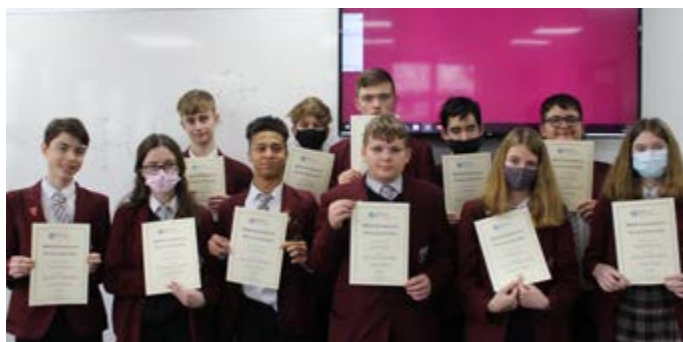
SILVER CERTIFICATE WINNERS

Congratulations to all the participants of the 2022 BPhO for these fantastic results, you have made the school very proud.