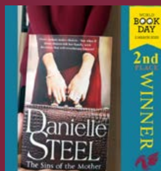
PAIGE IN YEAR 8 †