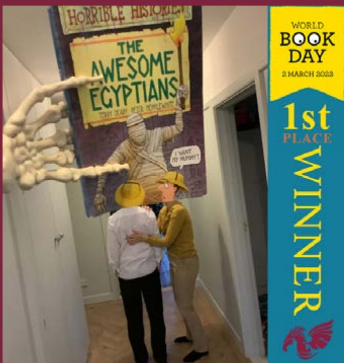
ADA IN YEAR 9 †