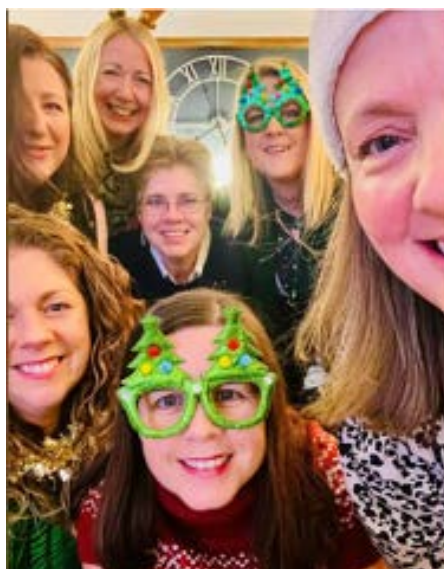
↑ Christmas Fun

AGM last October – What a great start to the new school year – handing over a cheque for £15,000 from fundraising last school year: ↓